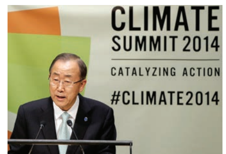
Ban Ki-moon, UN Secretary-General

100 FOR 50BY50 SAFE CLIMATE AND CLEAN AIR AT COP21