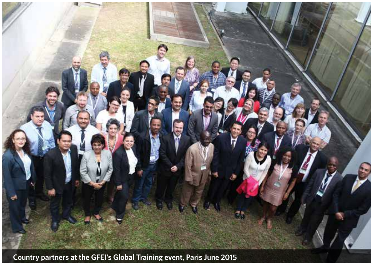
Country partners at the GFEI's Global Training event, Paris June 2015